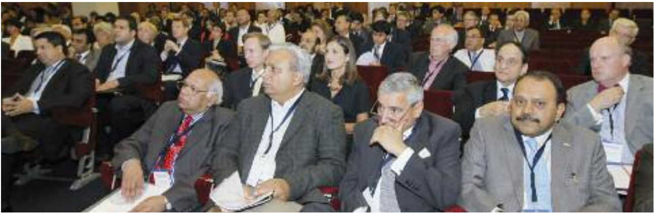
The 2011 Global India Business Meeting drew a collective audience of 300 delegates from 31 countries