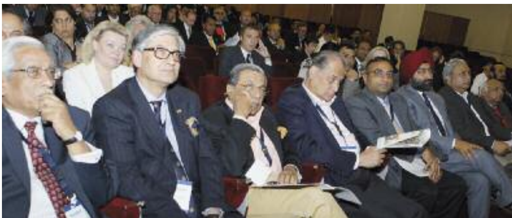
The 2011 Global India Business Meeting was wrapped up in an engaging valedictory discussion