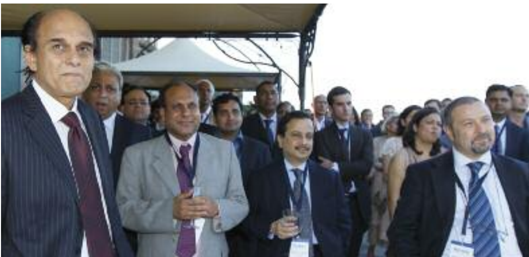
Participants listening to the welcoming words

Bhagat Group, India is naturally adept in managing Indian development and he presented to us early warning of a meeting in New Delhi in January 2012 focused on stimulating ethically sustainable development. In the background is management by ASSOCHAM a group established in India in 1920 to influence government with respect to trade and business enhancements. But, maybe, it has until recently been too accepting of the India love of discussion and democratic processes that coupled with the 'small government concept' assures us of a lack of palpable progress across all India.