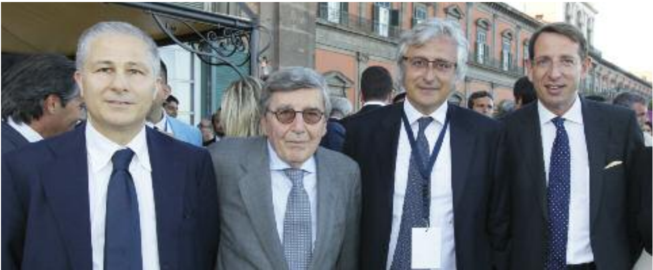
Italian Secretary of State Vincenzo Scotti with participants