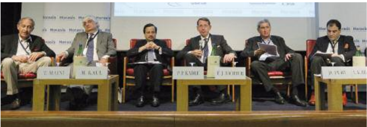
Plenary on Rethinking India's Trade and Investments

Commercial enterprise in India has the enviable opportunity to leap frog 20th century technology and move straight to 21st century zero carbon technology. Will the Indian government encourage and reward the private sector for their effort? The transition to a global green economy represents the single largest opportunity for economic growth in generations and, at the same time, offers a solution to energy security, climate change and job creation. Governments and businesses are starting to take action, including setting targets for energy efficiency or use of renewables, but several challenges must be overcome. They include ensuring a level pricing field for green technologies, and how to 'green' behaviour. A key factor will also be green investment and low-carbon innovation in the emerging economies: much of it led by China. Will India catch up?