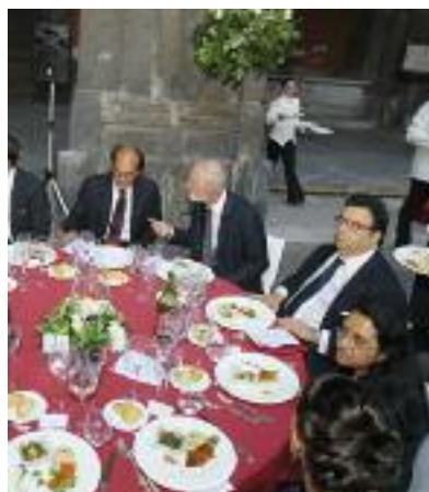
During the welcome dinner

Educating, training and employing this vast pool of undeveloped talent is one of the great challenges of the next ten years. What are the consequences of not mobilizing this effort? The Arab Spring was less to do with democratic Rights than to Rights to Resources. And what of women who make up nearly 50% of the population? The fastest way to transform society is to educate and empower women as they educate their children and transform their communities. Education at all levels is the