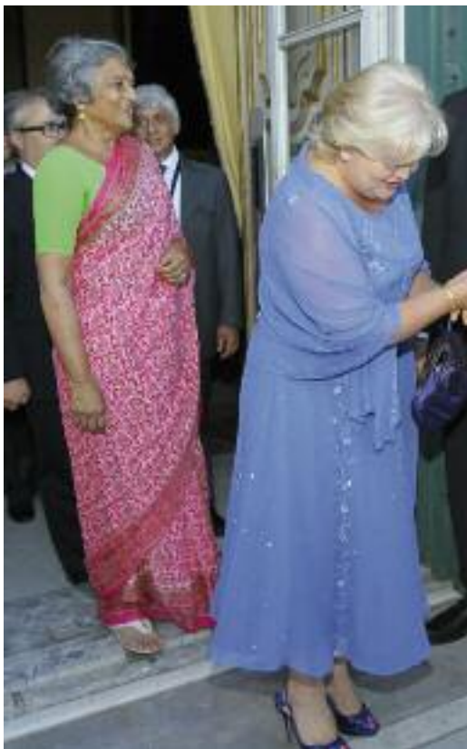
Arriving at the Royal Palace