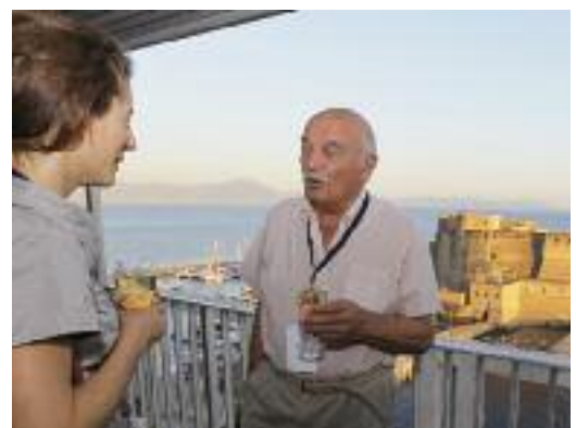
Closing reception overlooking the Castel dell'Ovo