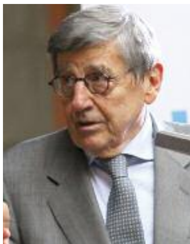
Vincenzo Scotti, Undersecretary of Foreign Affairs, Italy - our objective is to further strengthen our relationship with India