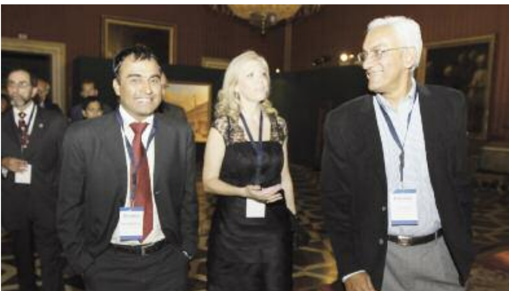
A noticeable positive mood at the meeting was evident - India's strong growth figures clearly instilled robust optimism