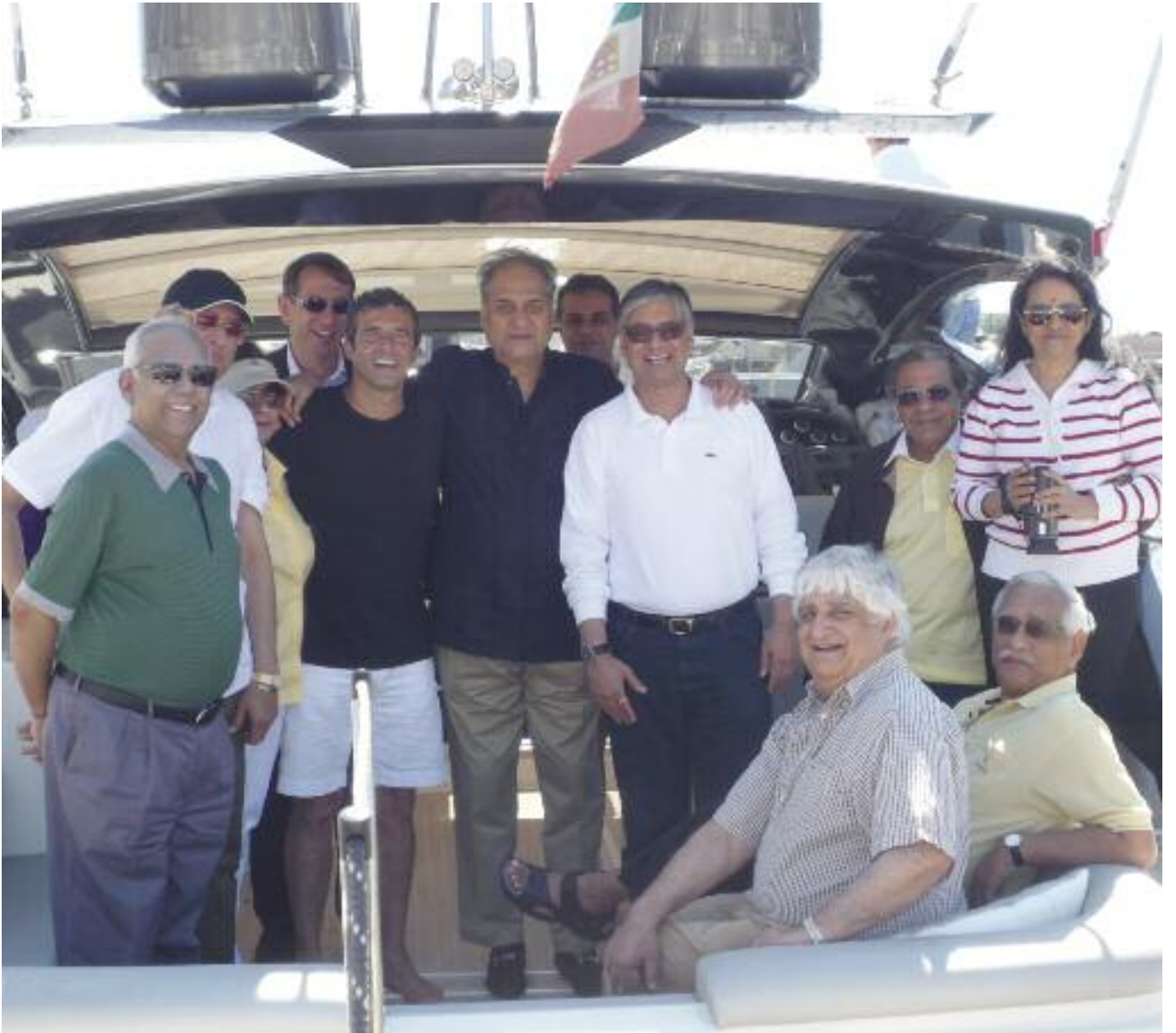
Indian business leaders leaving for Capri