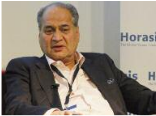
Rahul Bajaj, Chairman, Bajaj Auto, India, making a point at the opening plenary