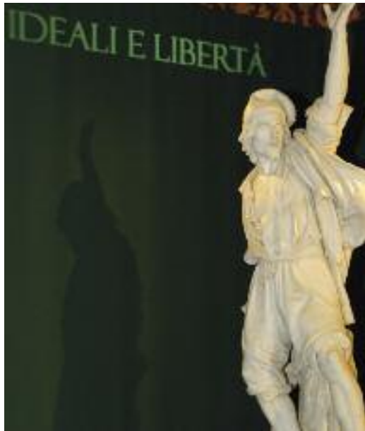
... business sentiment rebounds - India upbeat

investment in all types of infrastructure. This will rapidly increase the numbers of 'middle class' who will further accelerate the economy through its savings and its spending.