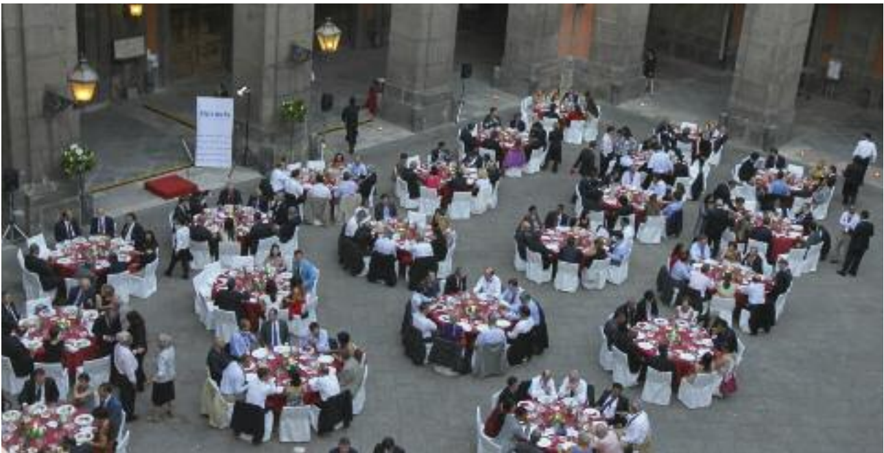
Preparing for the welcome dinner