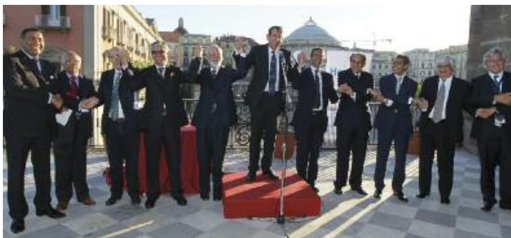
Virtual Ribbon Cutting Ceremony, with the co-hosts and co-organizers

The 2011 Global India Business Meeting focused on the changing paradigm of the global and Indian economies and discussed many questions - how might the fallout of the Japanese disaster and the changes in the Arab world impact the Indian economy? Will the dramatic cuts in public sector spending in much of the developed world derail global recovery? Could the disruption