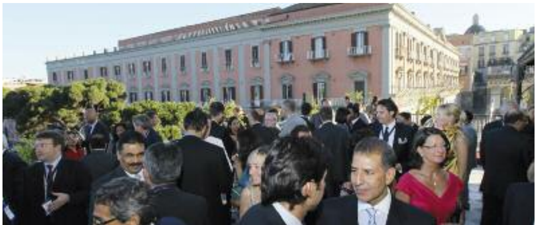
Overlooking the historic center of Naples

The delegates were all open, full of good humour and yet quite sharp. After all most were leading members of that elite club of global managers who knew intimately the chasm existing between their internal (in India) and external operations (sometimes in many overseas countries) – they spoke eloquently and authoritatively of desirable changes required in India, but without the need to be revolutionary: it is not their way.