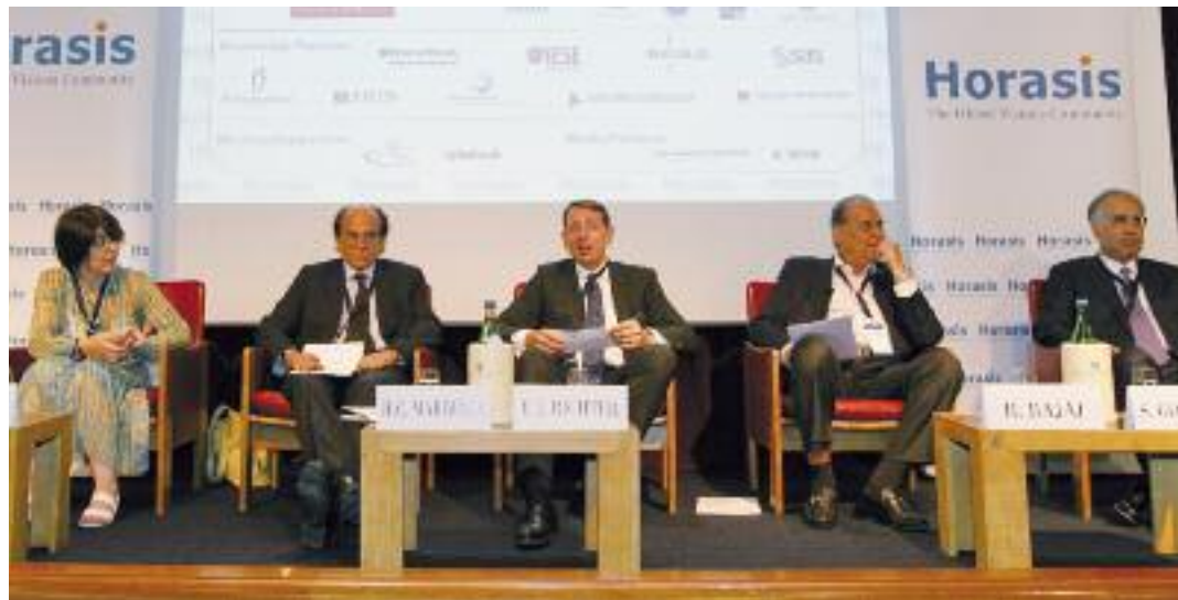
Opening plenary - focusing on identifying the key factors that will shape India's economy over the next 6 to 12 months