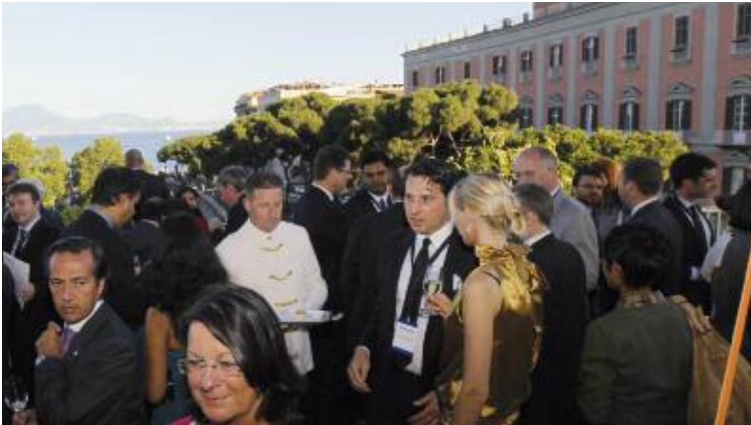
The meeting provided for a convivial atmosphere of friendly and constructive community building