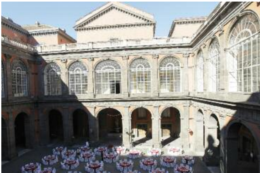
The Royal Palace of Naples - venue of the opening dinner