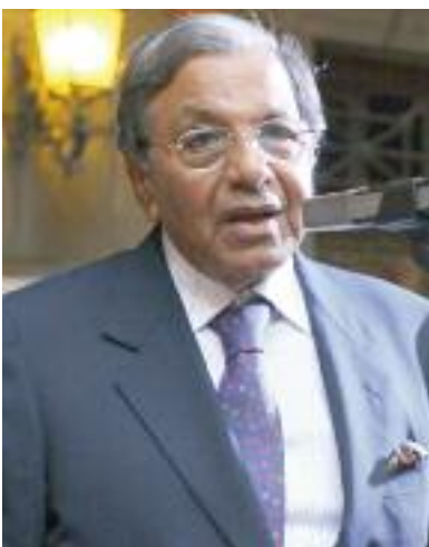
N.K. Singh, Member of Parliament, India - pitching India as a global leader in the next wave of globalization