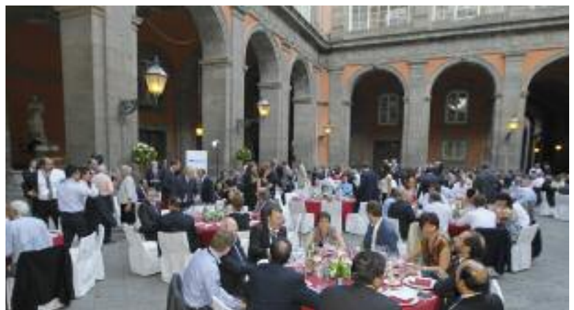
The meeting brought the region of Campania to the global attention and opened the regions attraction for trade and investment from India