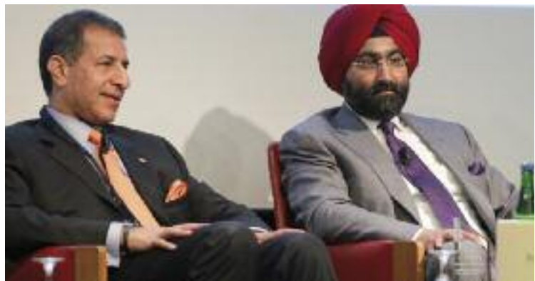
Rajan Bharti Mittal and Malvinder M. Singh