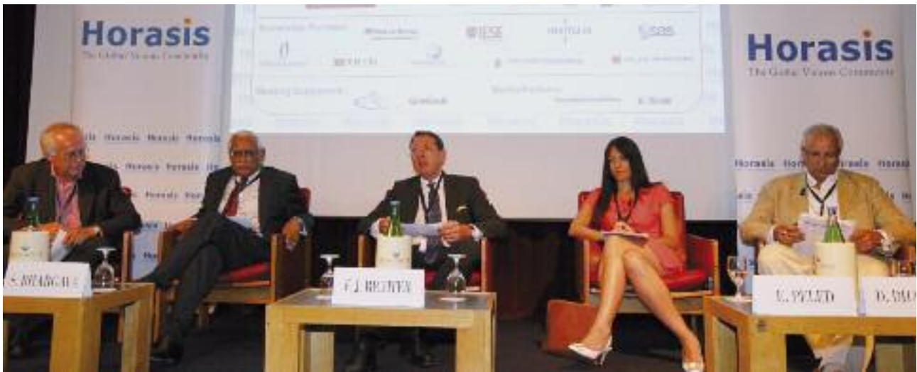
Closing plenary - the road to inclusive globalization

domestic banking market in the world in the next three decades. With an encouraging regulatory framework in a growing economy global and Indian players should strive to obtain new licences and also expand on new products in the coming years.